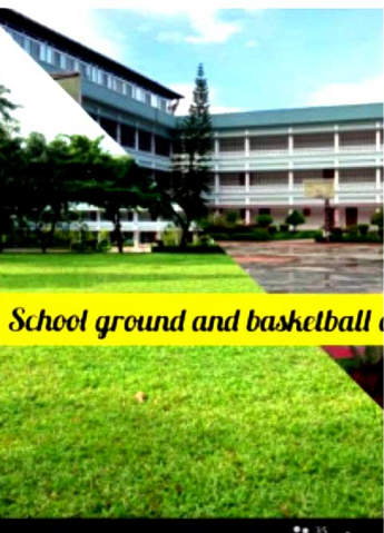
School ground and basketball court